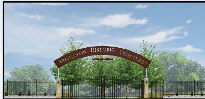
A new entryway will be inviting for visitors and provide prominence to one of Arlington's most preserved elements of history.