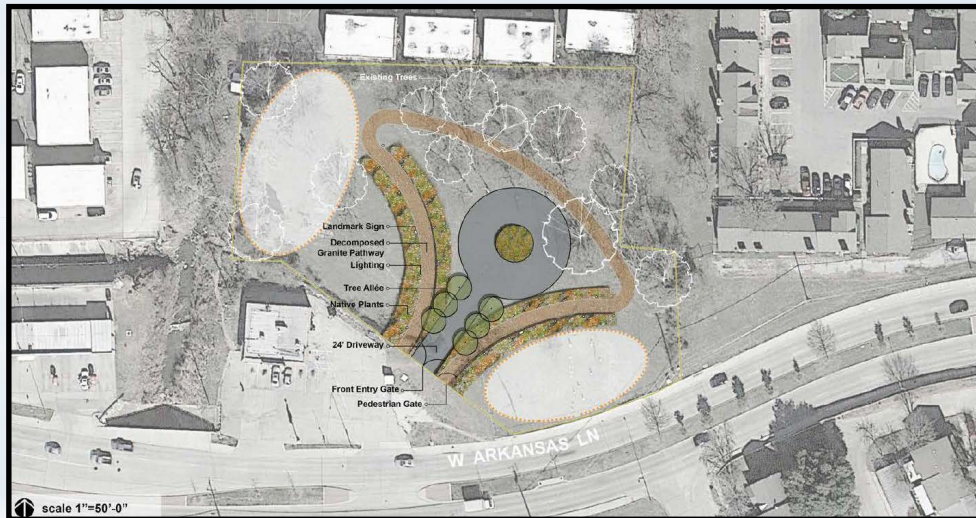
Pedestrian paths will be decomposed granite with lighting and native plant landscaping. A small vehicle path will also be included.

Finally, we want the Historic Cemeteries on Arkansas Lane to be an interactive learning center for residents and visitors of all ages to learn about Arlington. With the help of the Arlington Urban Design Center, we have developed a path with information boards to guide visitors through the cemetery in a curated and informative way.